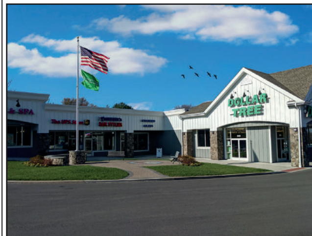
Renovation Size: 10,000 SF

Audubon Village Shopping Center is an older shopping center, comprised of multiple additions from the 1960s, 1970s, and 1990s to create one strip center and had a vacant, anchor building from 1991 on the same site. The key to revitalizing this center and enticing an anchor tenant lay in creating a cohesive design that spanned the two buildings. The client opted for a traditional look that matched the neighboring area, so the design includes new gables, subtle arches, stone pillars, and vertical siding. They used the same materials on the separate gabled building, which was filled by Redner's Market.